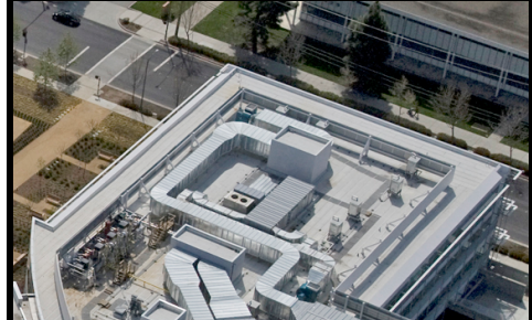
Virtual Ductwork to Reality