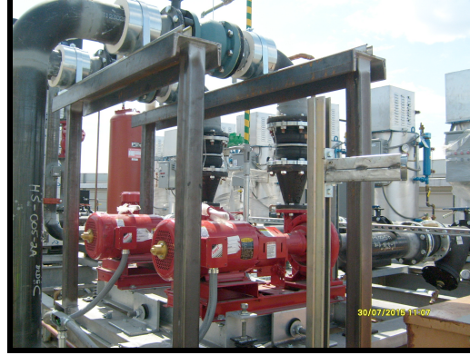
Virtual Piping to the Real Thing