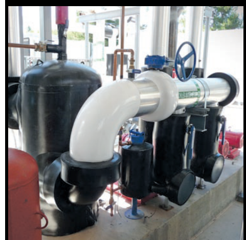
From Virtual to Reality