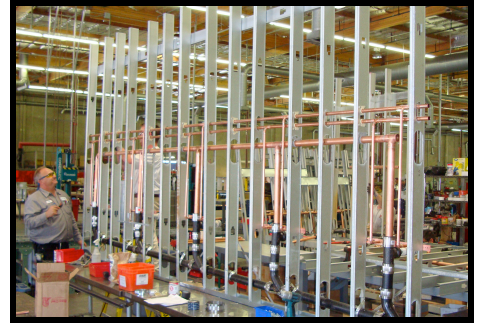
Plumbing Prefabrication in our Shop